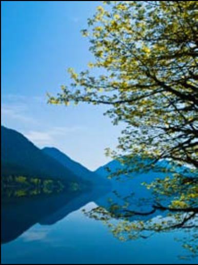
Lake Crescent with Maple