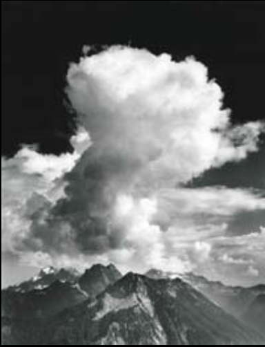
Mount Dickerman