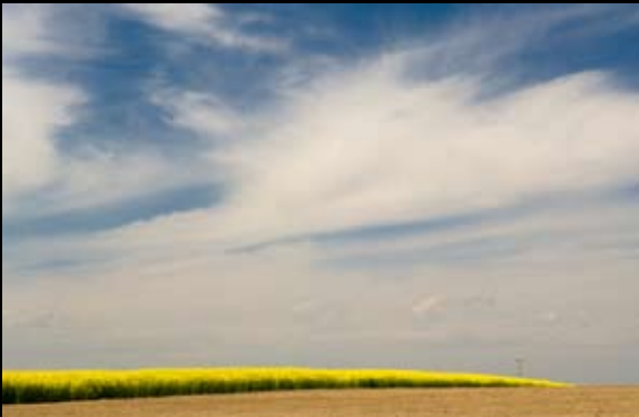
Spring Canola