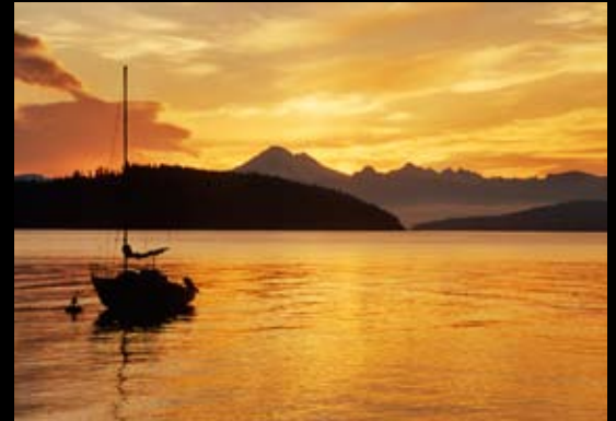
San Juan Sunrise