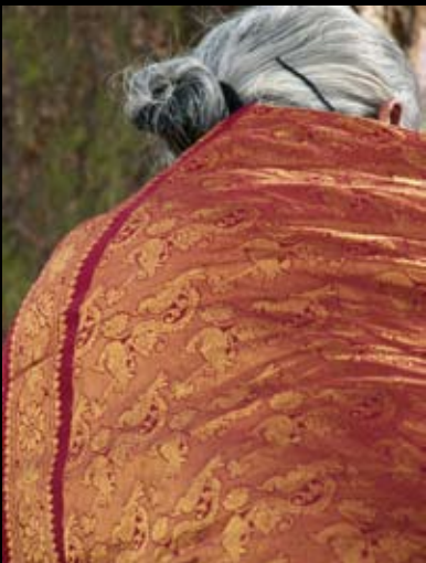
Hare Krishna Festival