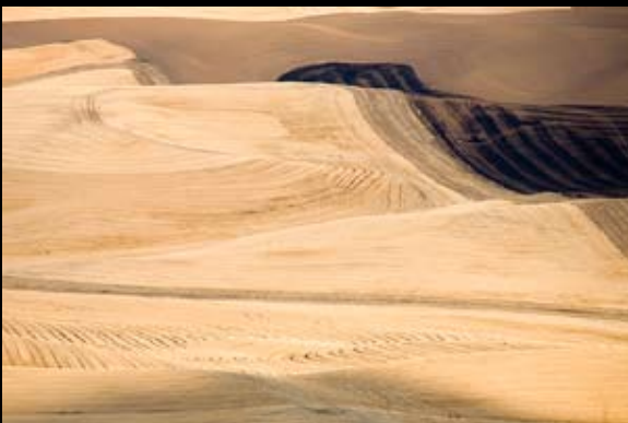
Burned Field