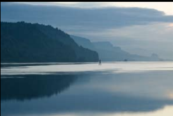
Columbia River At Dawn