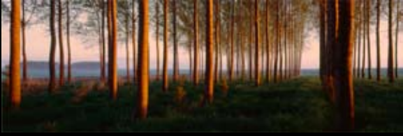
Sunrise in Othello Poplar Grove